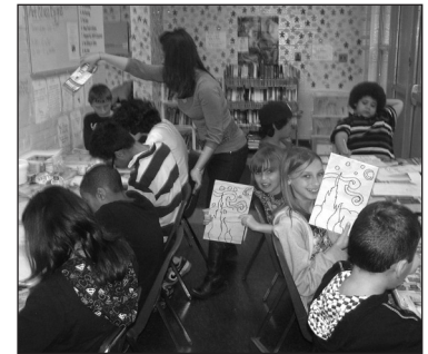
Milford Boys & Girls Club grant