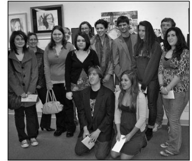
Scholarship recipients & their teachers